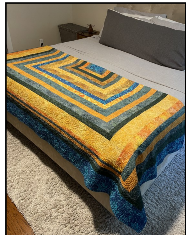
" Llamas in Tennis Shoes" Back: Lavender Ice Cream by Kaffe Fassett