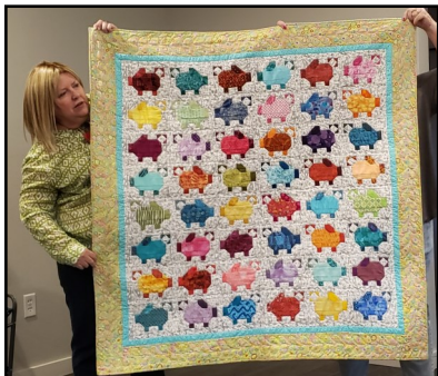
Teresa Galegher "Piglets in Paris" Based on a tutorial from the blog "The Objects of Design" The background fabric has the Eiffel Tower and French Poodles thus the name "Piglets in Paris"!!