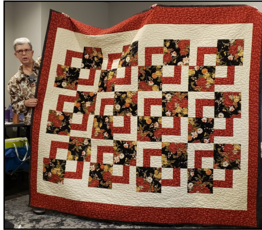
Pam Roark "Trailer Quilt" Made from pattern "Roman Holiday" in a book "Quick as a Wink, 3 Yard Quilts" Quilted by Yellow Rose Quilts